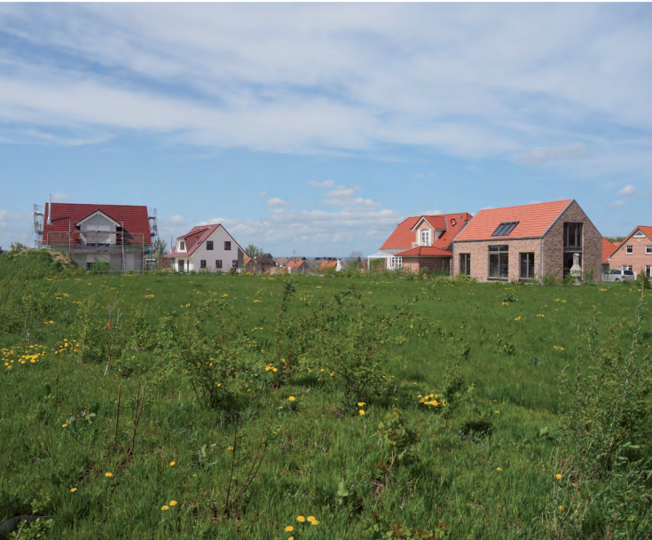
Settlement area? Open Space? Agriculture?