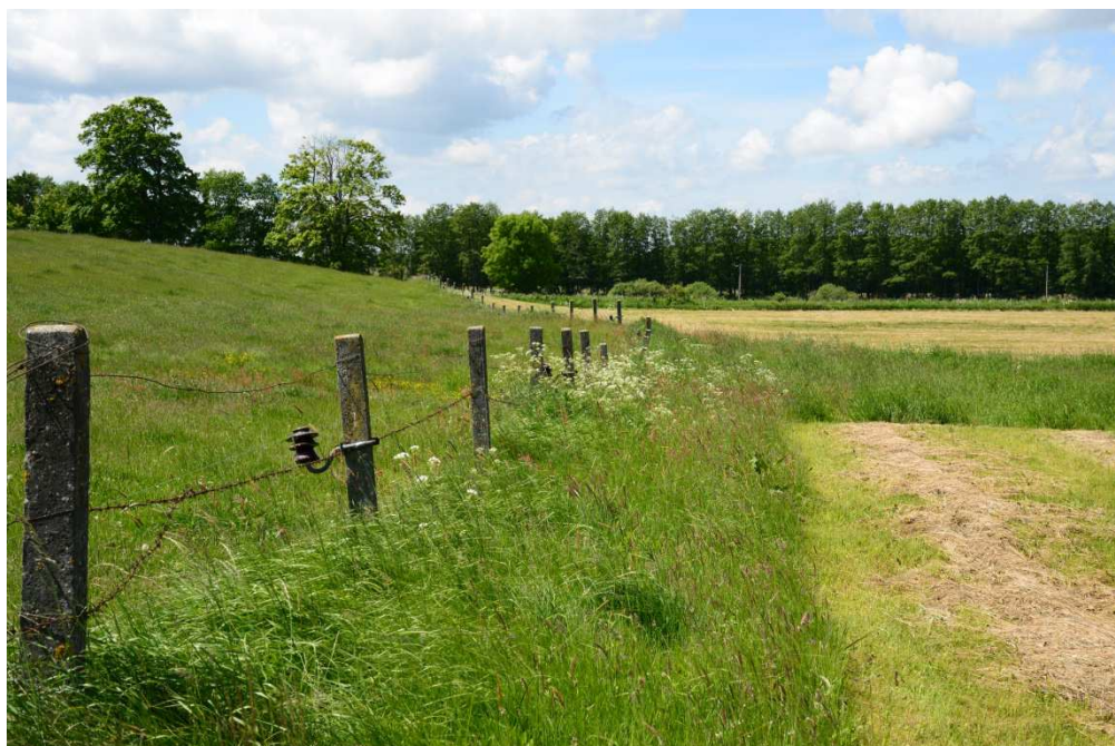
Examples of ecosystem services provided by flower strips: biodiversity, pollination and recreation | Source: © Frank Gottwald / ZALF | Picture in color and print quality: http://www.zalf.de/de/aktuelles